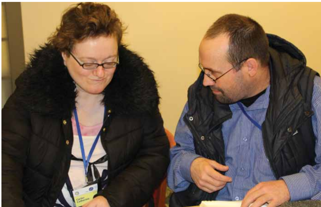
Table 9: We Asked Families: What is needed for you to support your family member to make his/her own decisions?